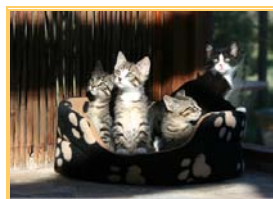
4 kittens born Feb'11