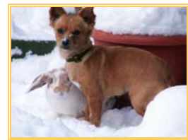
Honey in Holland