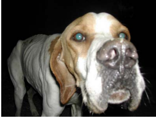
Tobo the day he was found

Tobo is a gorgeous English Pointer. Tobo is approximately 3 years old. He was found in Lorca and was being fed by a lady at a warehouse. This was very dangerous as lorries came and went the whole time. He was extremely skinny. He was in need of immediate Vet treatment, after receiving this he was taken to our emergency foster carers and after a week of love and care he went to San Animal foster carers. The plan was that he would stay in foster care with them for the time being. He is good with people, children and other dogs. Take a look at the photos below, the first being taken the day he was rescued and the second a couple of weeks after settling with his Foster Carers. Tobo is still receiving treatment which will continue for sometime but San Animal are very lucky to have people around us who really care for the animals as Tobo has now been adopted and renamed – Hero – thank you to all who helped in her rescue and adoption.