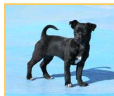
Polly Pocket (F)