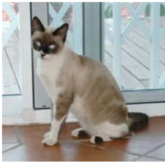
Mum of Siam & Tabby