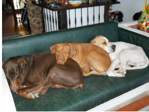
Two weeks after he was found What a wonderful life now!!!!