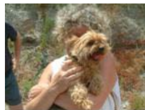
August 2010 Yorkie (see above)