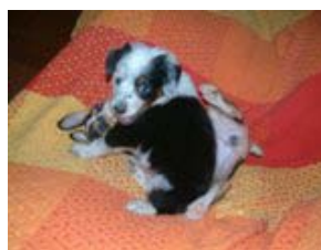
September 2010 Romeo's friend found in Purias