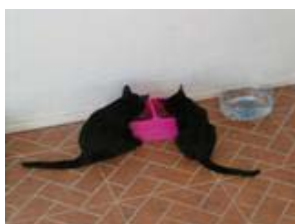
Rocky & Lucky