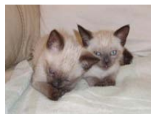
Furby & Ping Pong