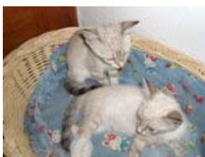
Tigra & Socks