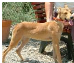
August 2010 Jolly (now Joy) Retrieved in Aguilas