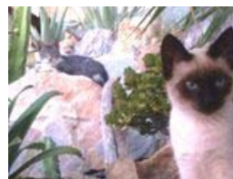
Kittens - approx. 5 months

PLEASE HELP ~ FOSTER CARERS URGENTLY REQUIRED