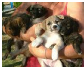
July 2010 Puppies found in Drain hole close to Bar Fuente, Purias