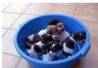
October 2009 Puppies found on roadside near Purias